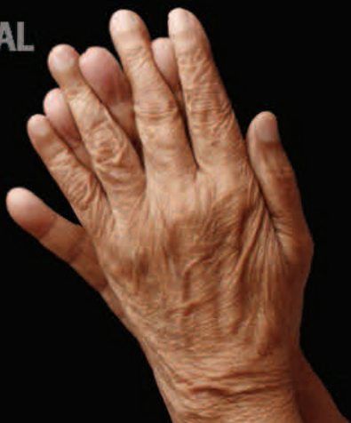
Cover Photo : Praying hands of an old woman